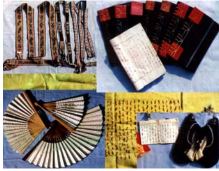
Nüshu works sample