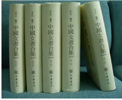
The cover of Chinese Nüshu works Collection