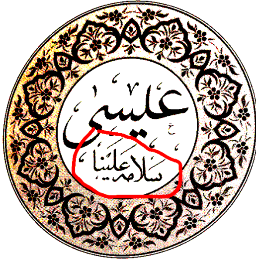
Figure 3. The honorific in spelled-out calligraphic form, from al-Nasrī 2019, p. 641.