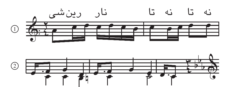
Figure 15-8. Examples of Specialized Music Layout

The opposite approach is also known: in some traditions, the musical notation is actually written from right to left. In that case, some of the symbols, such as clef signs, are mirrored; other symbols, such as notes, flags, and accidentals, are not mirrored. All responsibility for such details of bidirectional layout lies with higher-level protocols and is not reflected in any character properties. Figure 15-8 exemplifies this principle with two musical passages. The first example shows Turkish lyrics in Arabic script with ordinary left-to-right musical notation; the second shows right-to-left musical notation. Note the partial mirroring.