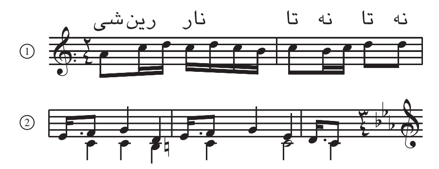
Figure 15-9. Examples of Specialized Music Layout

Similarly, format characters have been provided for other connecting structures. The characters U+1D175 MUSICAL SYMBOL BEGIN TIE, U+1D176 MUSICAL SYMBOL END TIE, U+1D177 MUSICAL SYMBOL BEGIN SLUR, U+1D178 MUSICAL SYMBOL END SLUR, U+1D179 MUSICAL SYMBOL BEGIN PHRASE, and U+1D17A MUSICAL SYMBOL END PHRASE indicate the extent of these features. Like beaming, these features are easily handled in an algorithmic fashion.