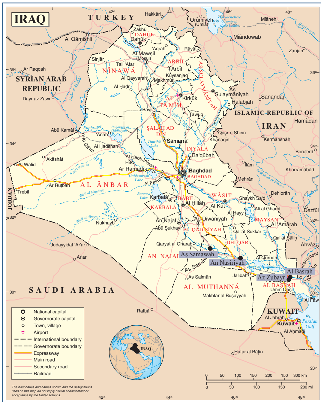
Map 1. Sites tested for depleted uranium contamination, 2006–2007