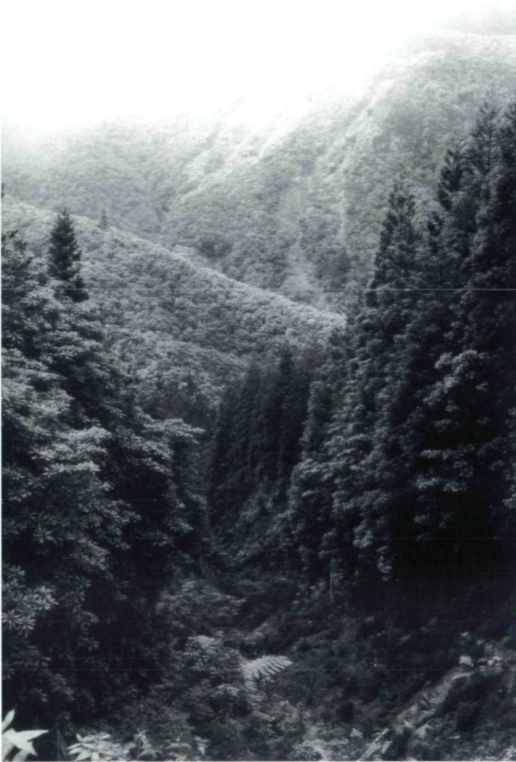
Fig. 7: Degraded habitat (with introduced Cryptomeria japonica and Clethra arborea ) of Pyrrhula murina on the slopes of Pico de Vara, Sao Miguel, Azores. – G. AUBRECHT, July 1995.