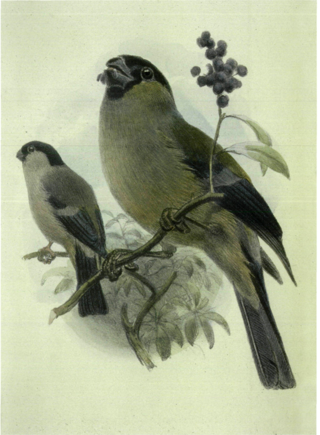
Fig. 2: Azores Bullfinch Pyrrhula murina . Plate from GODMAN's scientific species description (GODMAN 1866, plate III). The printing of this figure was sponsored by travel agency TUI, Linz.