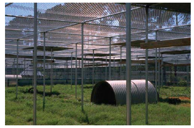
Figure 2. Inside view of one of the outdoor holding corrals at the Tulane National Primate Research Center.

The animals sampled for this study were from the TNPRC SPF colony and the WaNPRC SPF and baboon colonies. At the time of inventory, physical examination, anthelmintic treatment, pregnancy determination, tattooing, and blood sample collection were performed as part of the semiannual preventive medicine program. All inventory procedures were performed in ketamine HCl (10 mg/kg IM) anesthetized animals. Blood was collected from the